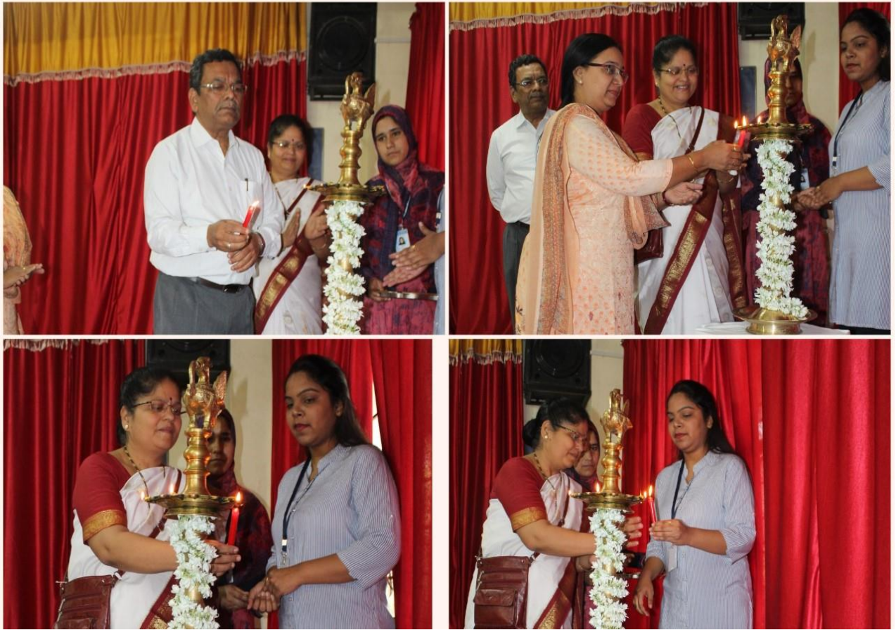
INAUGURATION AND LAMP LIGHTING CEREMONY